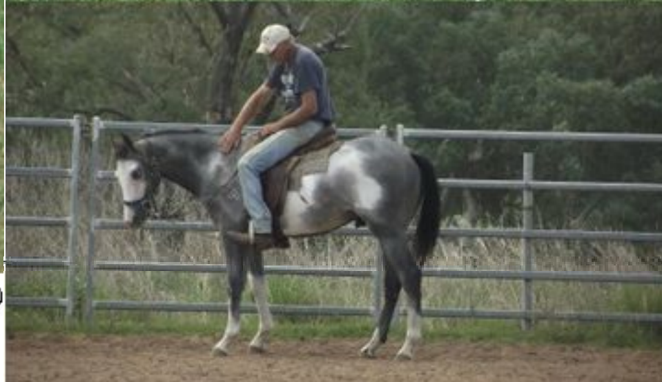
Above: Luna Park (Profile IN Style) Top right: Red Gold n Green (Glacial) Right: Hat Trick (Profile)