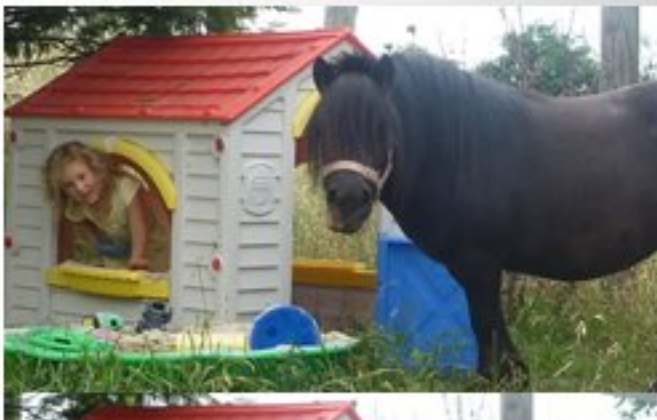
Below: Starspanglebanner . Note the belly patch near his groin.