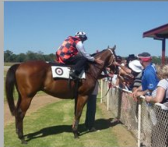
Above: Crowd favorite Takeover Target at the Parkes Cup Race Day