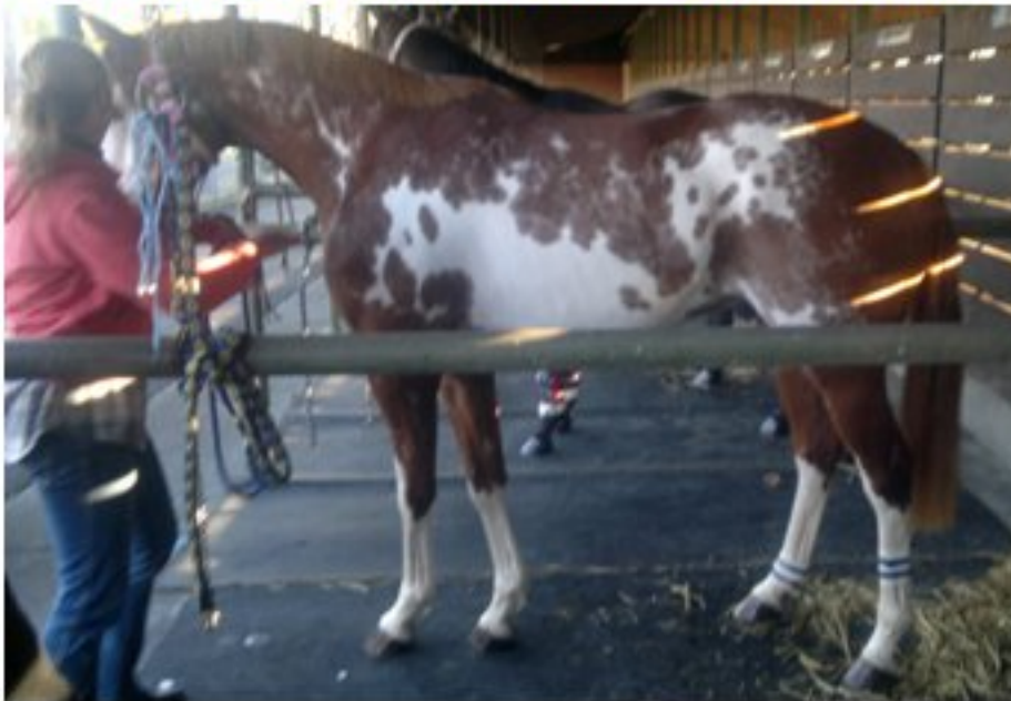
Framed In History at Kembla Grange racecourse, NSW.

He is still quite green and with only 8 weeks back in training under his belt (and with him arriving back at the race stables too fat - blame the "Dynamite"), we won't see his full potential this start, however they all have to start somewhere (unless of course your name is Black Caviar!). Wagga Wagga races on the 3rd of September is the place for the maiden race.