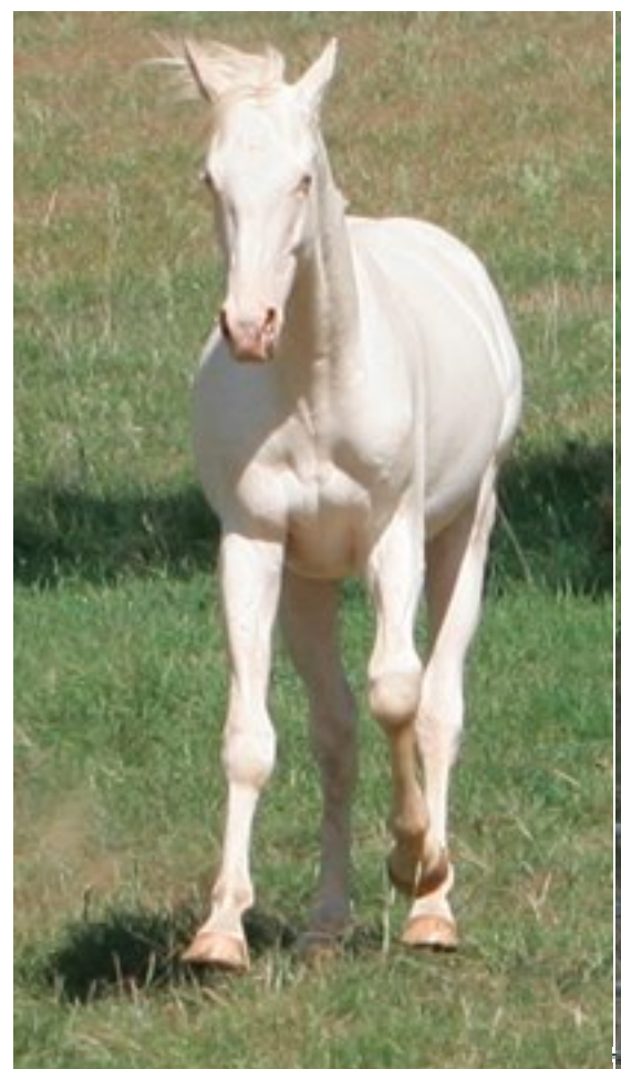
Above: Luna Park (Profile IN Style) Top right: Red Gold n Green (Glacial) Right: Hat Trick (Profile)