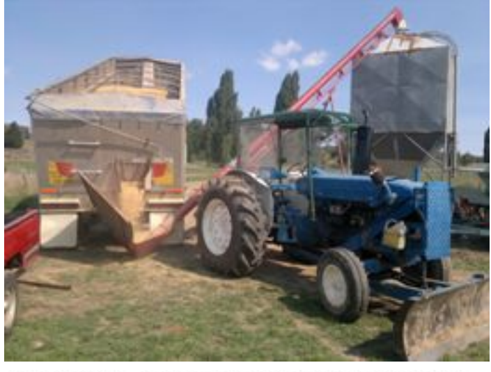
Getting the silo filled for the daily oatmeal feast and someone had to shut the silo lid.

I am usually afraid of heights but decided to take up the challenge from Grant.